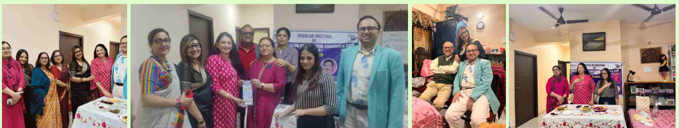
539th Regular Meeting and Fellowship Meet