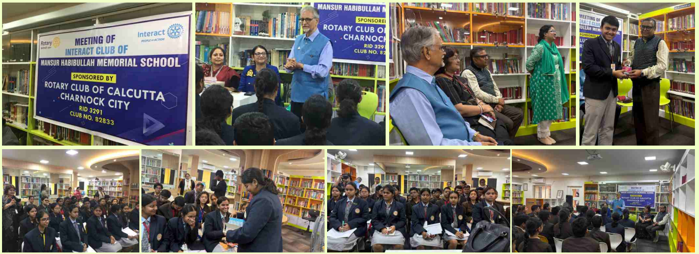
First Meeting of the Interact Club