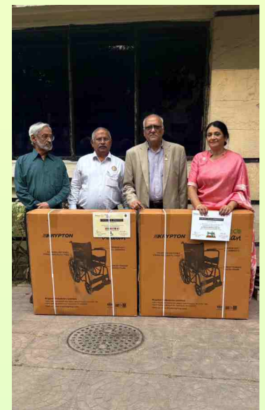
Handed over to SAYANHE for elderly residents on 30th December