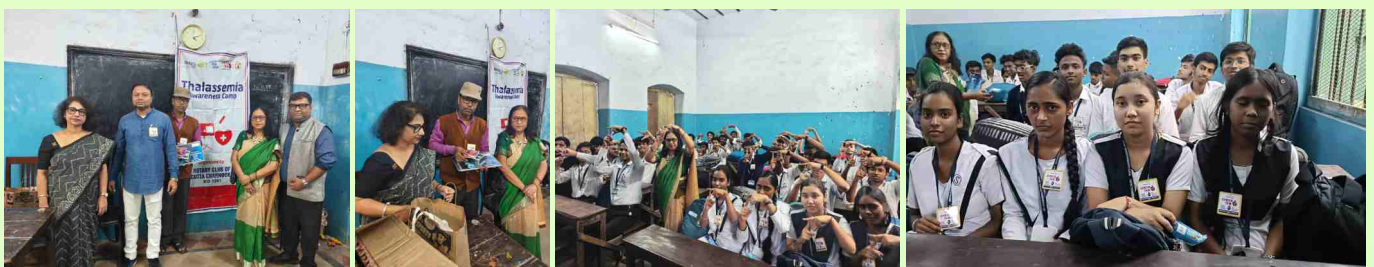
Thalassemia Awareness Seminar at South Suburban School