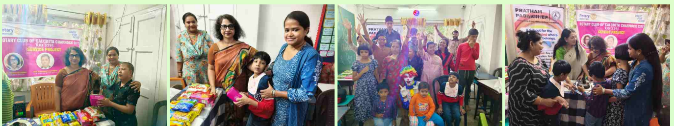
Teachers Day Celebration at Pratham Padakshep