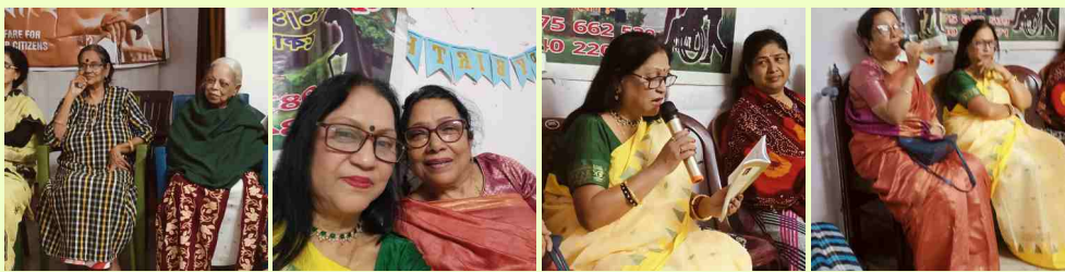
Monthly visit to SAYANHE