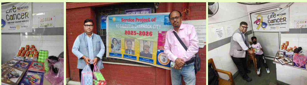
Monthly visit to SSKM