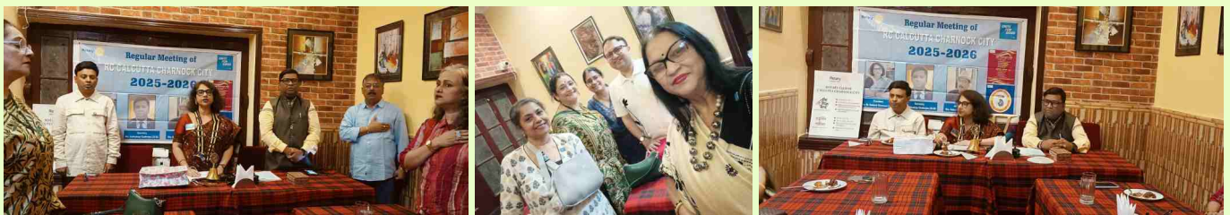
Photos of 537th Regular Meeting and AG VISIT